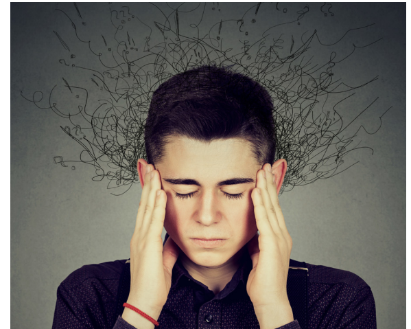
Cornell Health can connect students with ADHD to the testing, treatment, and support needed to succeed.

Cornell Health is expanding our scope of care to include diagnostic evaluation for ADHD (when clinically indicated), using current standard-of-care assessment techniques.