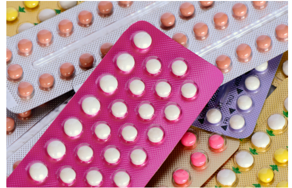
Your birth control pills may look different. There are many varieties.