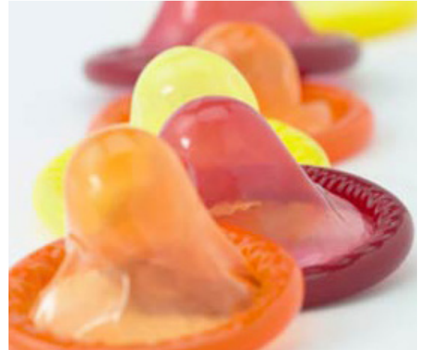
Adding lube increases sensation and also lessens the likelihood of condom breaks.

Use condoms before they reach the expiration date (check package). Extreme temperatures, body heat and oil-based lubricants and creams weaken latex. Do not store condoms in a wallet, pocket or car glove box for more than a few days.