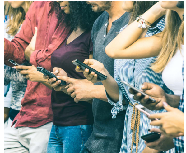
Dating apps can be a great place to meet new people, and may carry potential risks

Once you’ve posted something, try not to judge your success based on the number of swipes, hits, likes, or messages you receive. The quantity of responses doesn’t always equal quality and isn’t reflective of your self-worth. Your dating profile can capture all of the wonderful, unique aspects of you, and the reality is that most users spend mere seconds on each profile they come across.