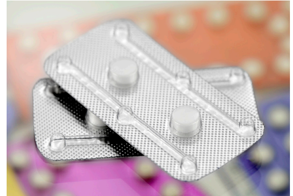
Emergency contraception (pills or IUD) is an option for up to five days after unprotected sex, but should be used as soon as possible to maximize effectiveness.

Progesterone or copper IUD: Two types of IUD can be prescribed for EC: Mirena, which contains a small amount of the hormone progesterone; and Paragard, a non-hormonal copper IUD. Use of an IUD requires an appointment with a health care provider for insertion. In addition to EC, an IUD can be used as ongoing contraception for up to 8-10 years. Though highly effective, IUDs are not appropriate for everyone. Your provider can discuss the benefits and drawbacks of using an IUD as EC.