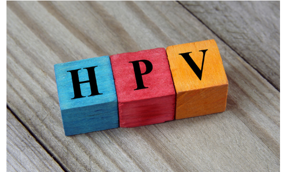
HPV is easily transmitted during unprotected oral, anal, or vaginal sex

Because most sexually active people will become infected with at least one strain of HPV at some point and not experience any problems as a result, routine testing for the presence of HPV is not recommended.