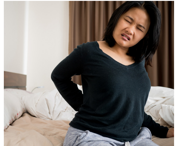
Learn to avoid (and treat) lower back pain.

Good posture can help prevent low back pain while poor postures can contribute to repeated