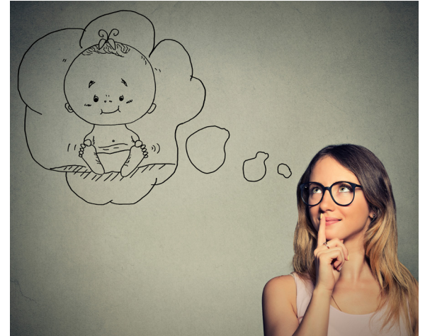
Planning ahead will help you do what you can to ensure a healthy pregnancy.

Now is a great time to take a careful look at your nutrition. Try to get an idea about your overall nutrition needs and the additional nutritional needs or pregnancy. Cornell Health offers nutrition appointments with registered