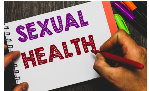
Prioritize your sexual health by reducing risks of STIs.