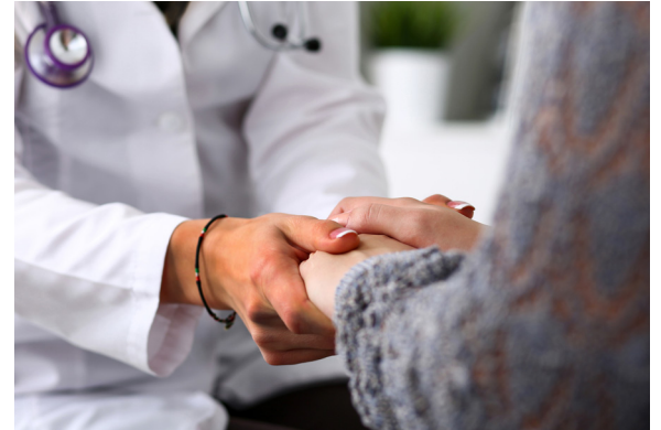
Cornell Health can provide consultation, referrals, and emotional support for students seeking an abortion.

Note: If you have had a positive home pregnancy test, you do not need a second pregnancy test at Cornell Health, but you may schedule an appointment to have a confirmatory test if you wish. Positive pregnancy test results of any kind are extremely accurate.