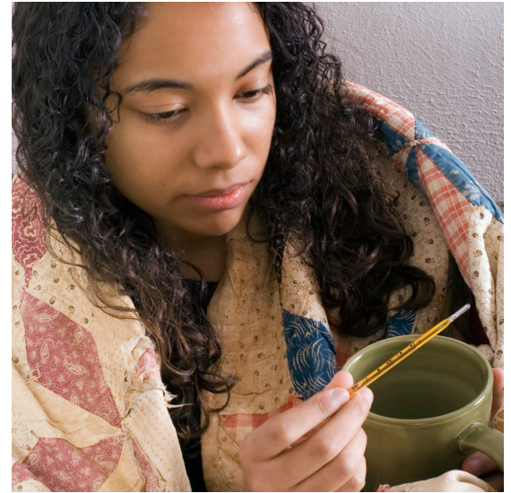
A URI (common cold) can affect the nose, throat, airways, sinuses and/or ears.