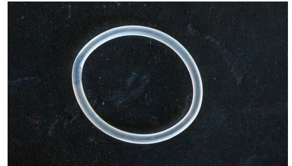
The clear, flexible ring is inserted into the vagina, releasing synthetic estrogen and progestin.