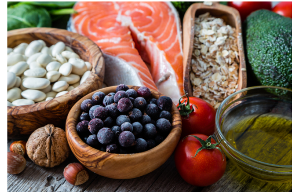
Students consult with CHEP about a variety of nutritional needs and related health concerns

CHEP is available to help Cornell students with nutrition, medical, and psychological information, evaluation, and care on campus. CHEP also provides specialized referrals for treatment outside the scope of services at Cornell Health. CHEP's