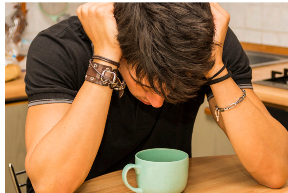
A “double-whammy” of vomiting & diarrhea is just no fun.

and diarrhea, it’s important to drink to replenish fluids. Review our suggestions for recovering from vomiting and/or diarrhea.