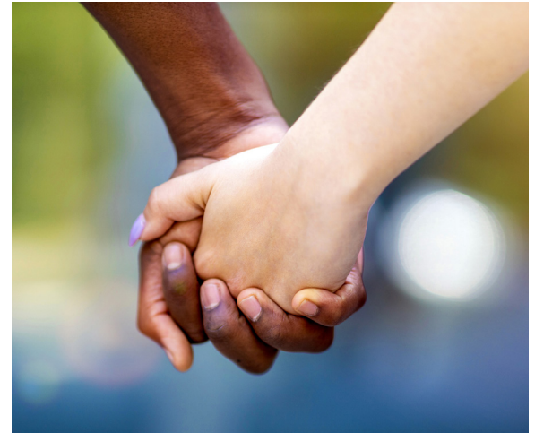
Several non-hormonal birth control methods are available to students.

The contraceptive sponge is a small, pillow-shaped polyurethane sponge containing nonoxynol-9, a common spermicide.