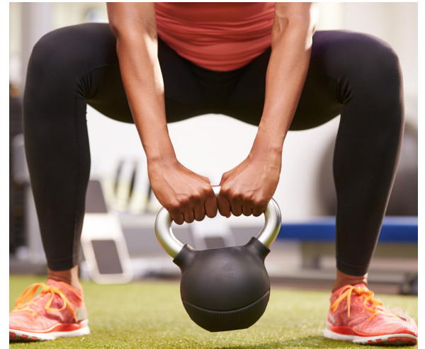
Maintaining proper posture is key.

Sit up straight and maintain your lumbar curve to avoid the stress that leads to back pain. An easy way to do this is to make sure you are sitting on your “sit bones” (ischial tuberosities). You can feel these bones in your bottom when you tilt your pelvis back and forth while sitting. You can maintain proper posture without back support if you keep your weight over your sit bones, your back erect, and your chest out. This may feel awkward at first because it involves postural muscles that you're unaccustomed to using. But within a week or so, good posture will become a new habit.