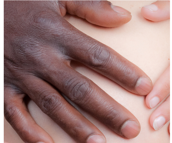
Key ingredients: Two trusting partners of any sex/gender.

Ideally, both partners are undressed, showered, and free of watches or jewelry. Designate one partner as the “toucher” and the other as the “receiver” to get things started.