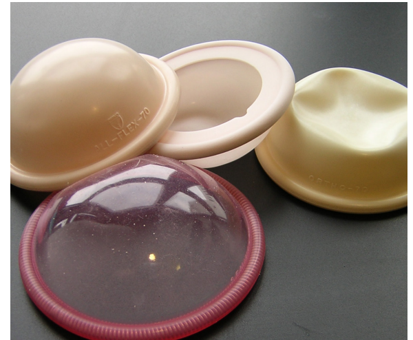
Diaphragms come in a variety of colors and shapes.