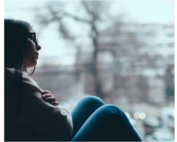
Even small self-care strategies can make a difference.

You're likely to be challenged by grey days for much of your time at Cornell, but the good news is that more than 85% of people with the winter blues can overcome these symptoms with various forms of therapy. See below for different strategies you may also consider.